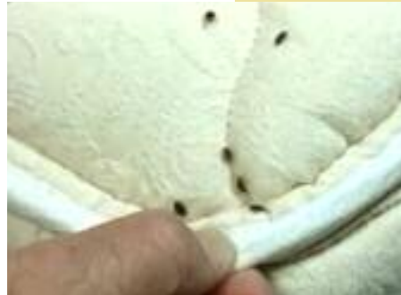
Bedbugs on a mattress

They can also live in any object that provides a dark, narrow space where they can easily hide. A crack wide enough to fit the edge of a credit card can harbour bedbugs.